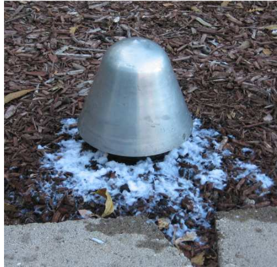
“Mushroom” type BPD relieves backups OUTSIDE the home.

By simply installing a BPD outside the home, the overflow will occur outside and avoid damaging your home.