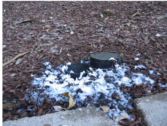
Loose caps allow sewage to escape. Don’t screw down or tighten caps. They must “pop” freely.

BPDs must be installed outside the home, and they must be maintained to ensure they are free of obstructions and freely